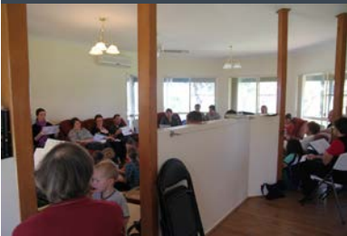
House church meeting in Hodgson Vale