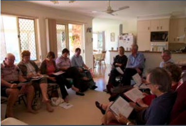
House church meeting in Toowoomba