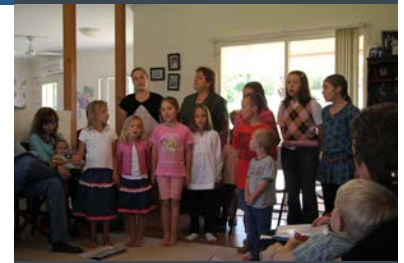
Kids singing at Hodgson Vale