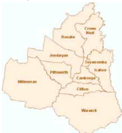
The Eastern Downs

This is the first new church planting in Australia among independent Churches of Christ/Christian Churches for many years. Australia is a resistive field and we know that we will face many obstacles in developing a strong congregation. However, we are also convinced that the message of reconciliation is the only hope for this world.