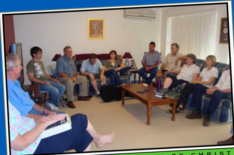
EASTERN DOWNS CHURCH OF CHRIST MEETING IN WESTBROOK