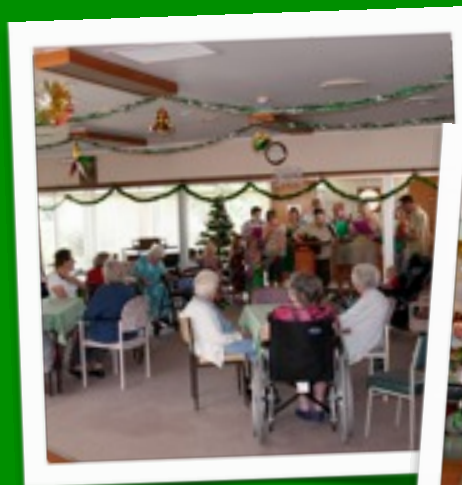
One of our members works as a Registered Nurse at this facility and opened the door for this opportunity.

On December 12, nineteen members from the Eastern Downs Church of Christ sang carols at a local nursing home. It is one simple way that we are trying to reach into our community.