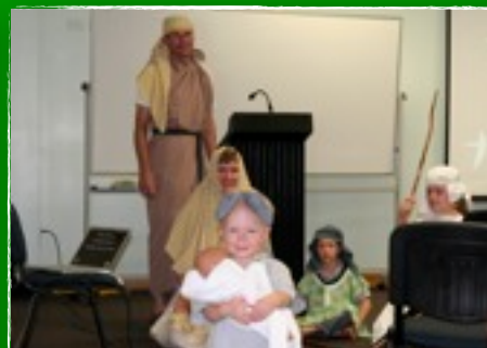
Christmas Play in Pittsworth