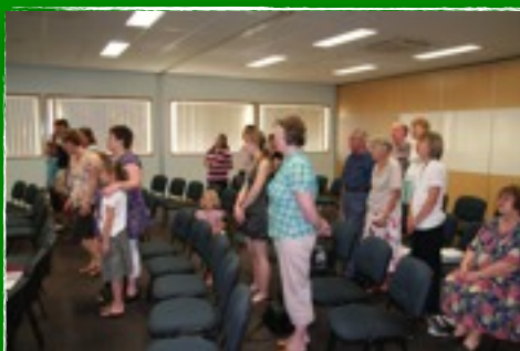
Pittsworth on Dec. 6

The next meeting in Pittsworth is scheduled for January 3 and weekly meetings will begin in Pittsworth on February 7. We have now canvassed the town with fliers on four occasions and will do this two more times before February 7.